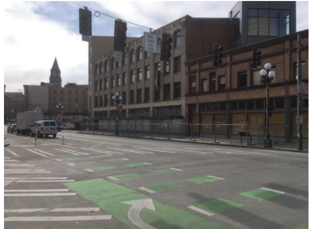
Photos: 300 block of 2 nd Ave. Extension South in Seattle, before (left) and after JustCARE (right).

JustCARE’s intervention thus appears to have dramatically improved the quality of life for JustCARE participants, as well as for people who live or work in the neighborhoods in which the targeted encampments were located. Any concerns community partners expressed about JustCARE centered on the unwillingness of the city and county to provide the funding needed to enable the continuation and expansion of JustCARE.