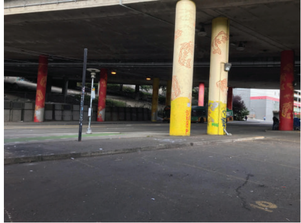
Photos: Northwest corner of CID Interim Parking lot at the intersection of 8 th & Jackson, before (left) and after JustCARE (right).